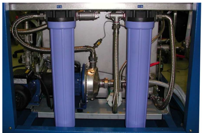
- Patented Filtration System -