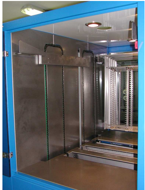
- Automatic Transfer System -