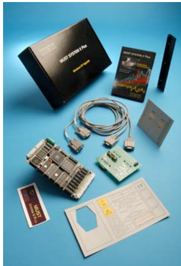
Windows XP / Lead-Free Upgrade