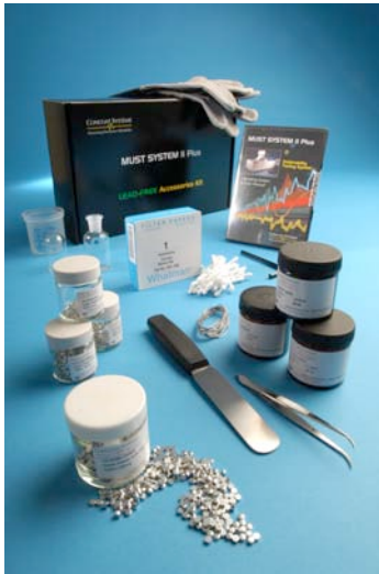
Lead-Free Accessories Kits