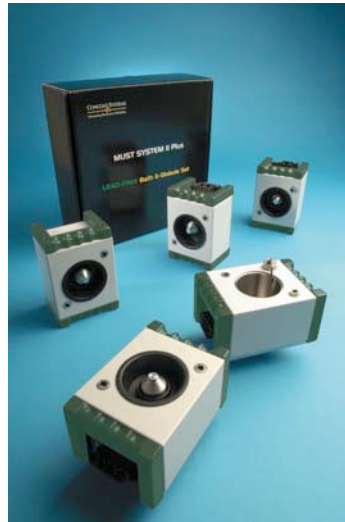
Lead-Free Bath & Globule Set