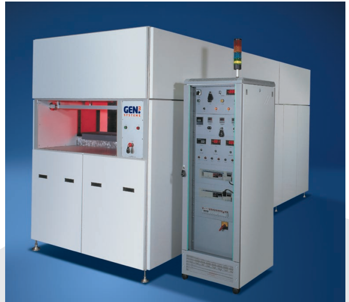
Model DC3005

The DC3005 system typically reduces coating consumption by more than 30% compared to continuous running conveyor systems