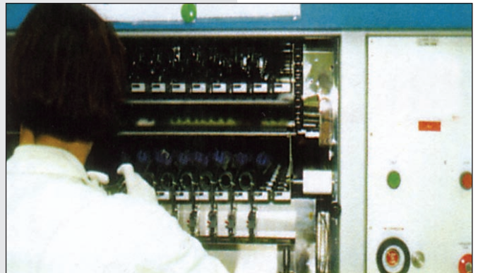
Model DC3005 (Courtesy of SOFREL Electronic Services SA, France)